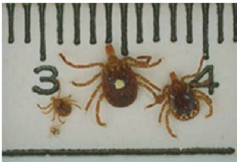
Larva, nymph, adult female, and adult male Lone Star tick (one inch scale)